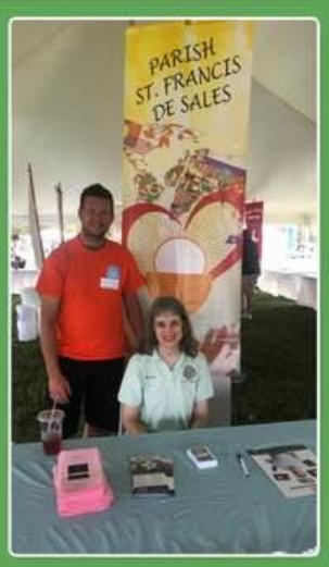
Saturday, September 14, 2019