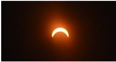
We even had a solar eclipse!