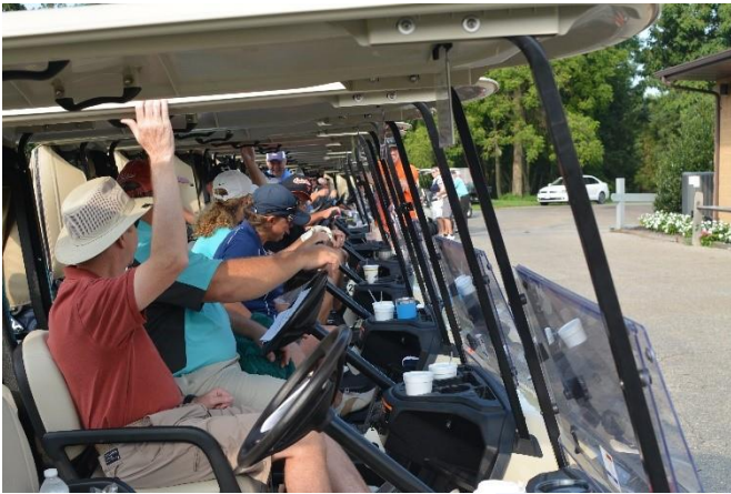
Golfers are Ready!