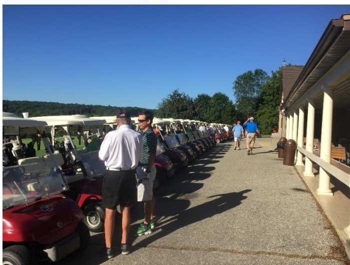
Action Shots from our Golf Tournament