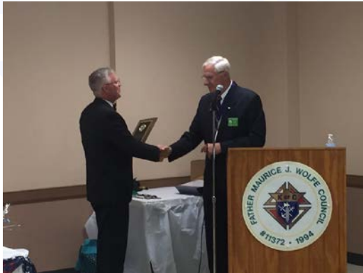
Passing of the Gavel