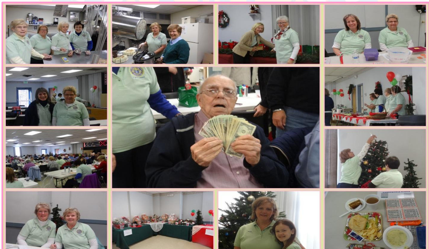
K of C Ladies Holiday Luncheon Bingo November 22, 2014