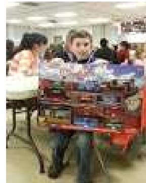
jackpot prize and game winners!