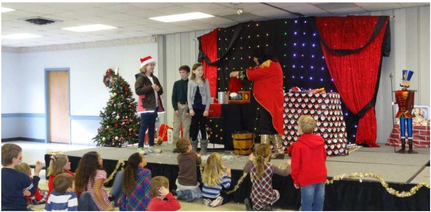
The Ever Popular Magic Show