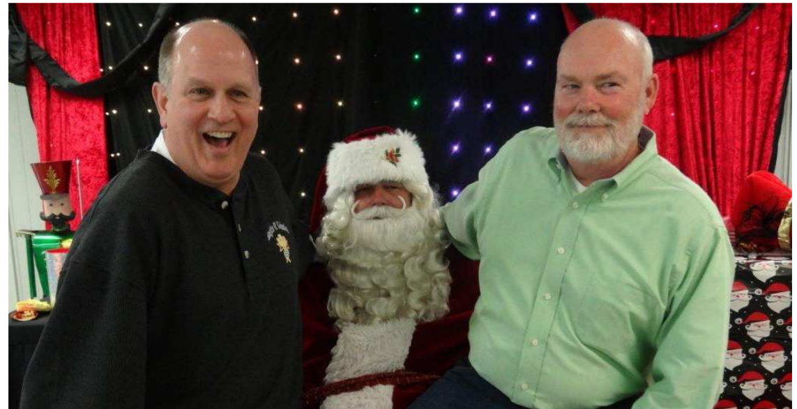
Two of Santa's Most Ardent Fans