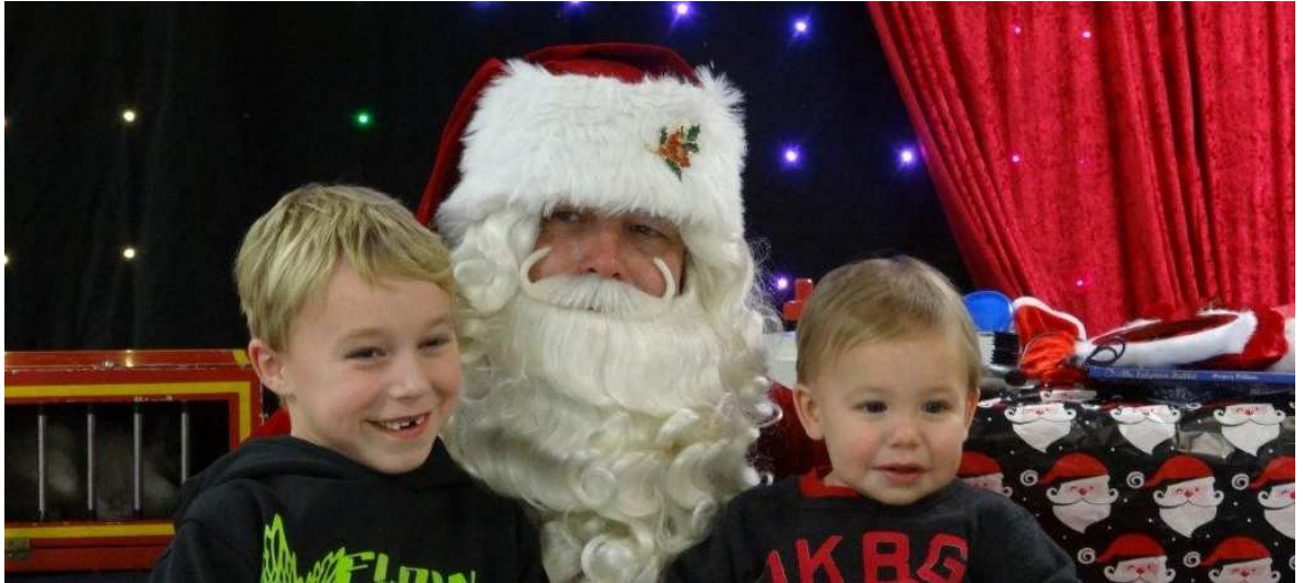
The Piotrowski Clan