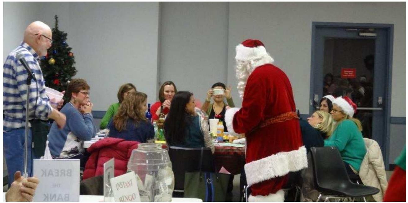
Santa delights the crowd