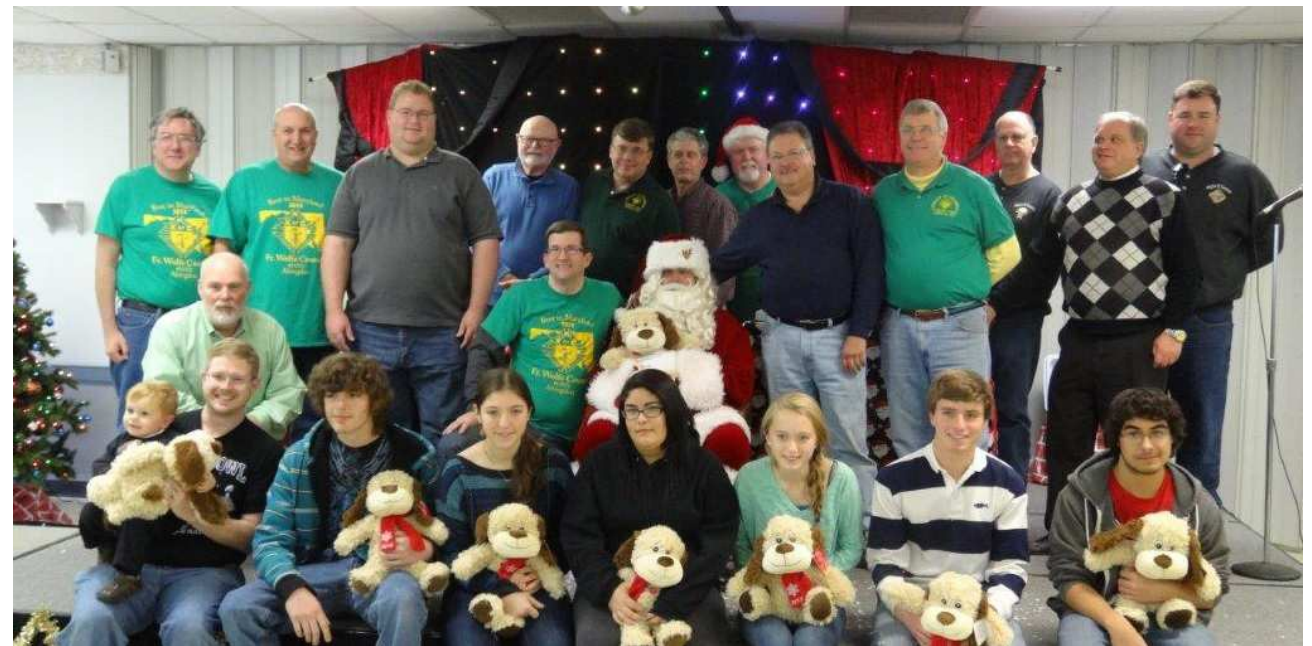
The Crew That Made It Happen