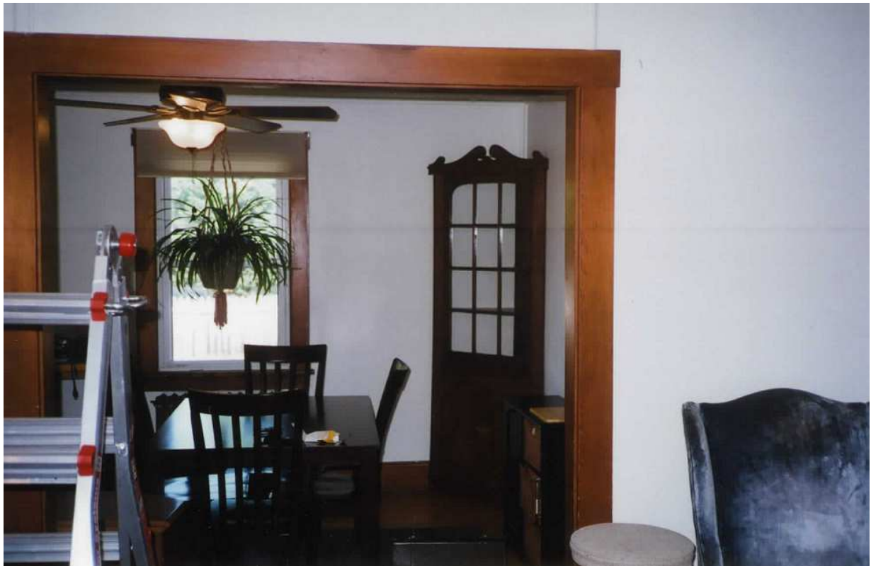
Four rooms, a hallway, and a set of stairs.