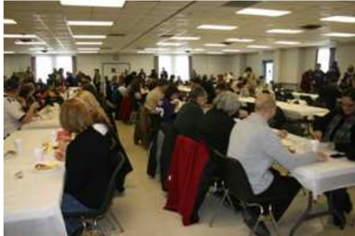
A great turnout