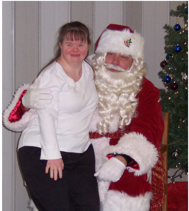
Santa Claus takes the time to talk to all our guests