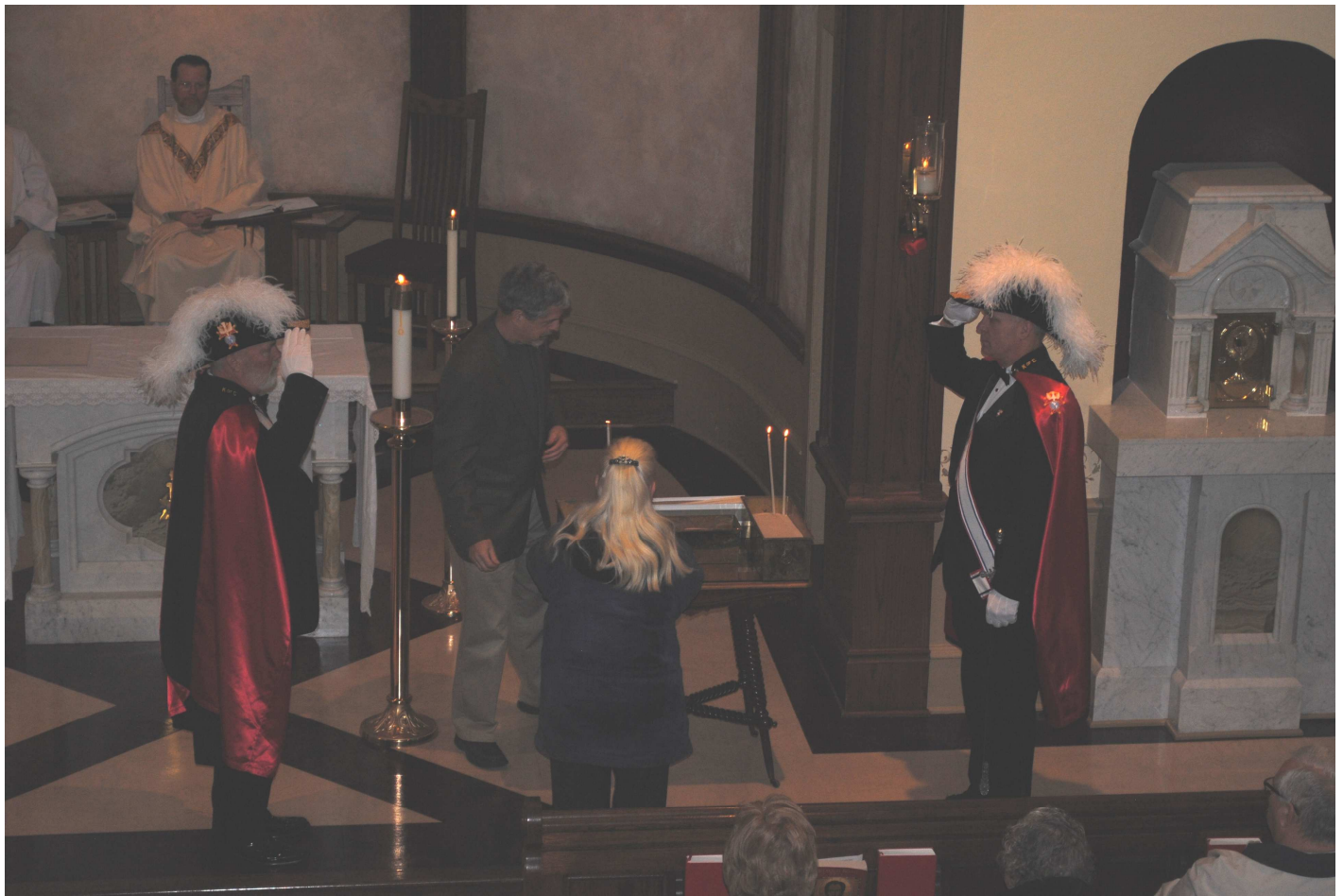
Lighting a candle for each of the departed.