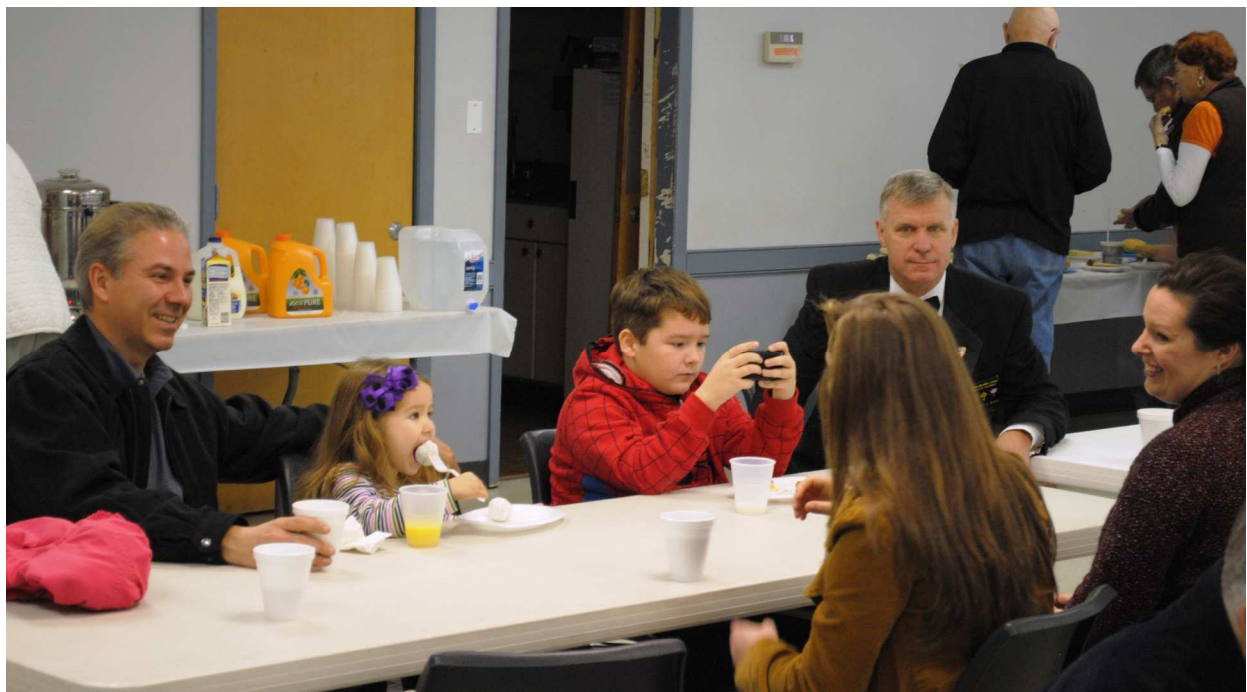
And we end with fellowship and the recollection of fond memories