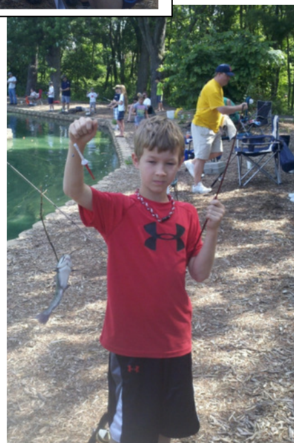
Look Mom, "Fish On!"