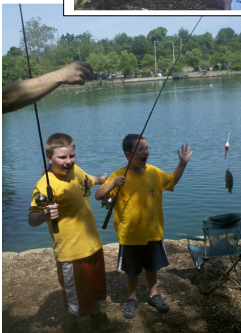
Nothing but Fun