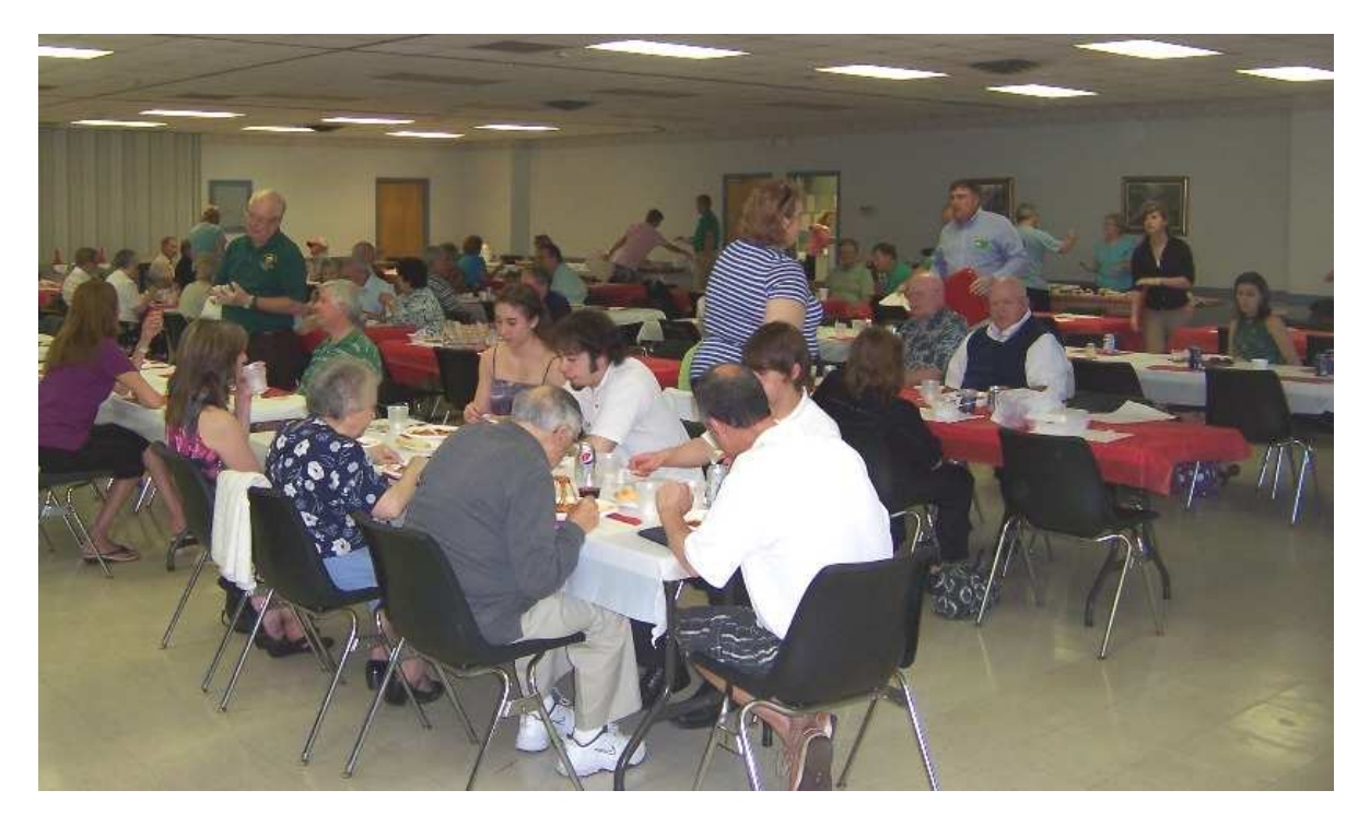
Everyone walked away with a full stomach