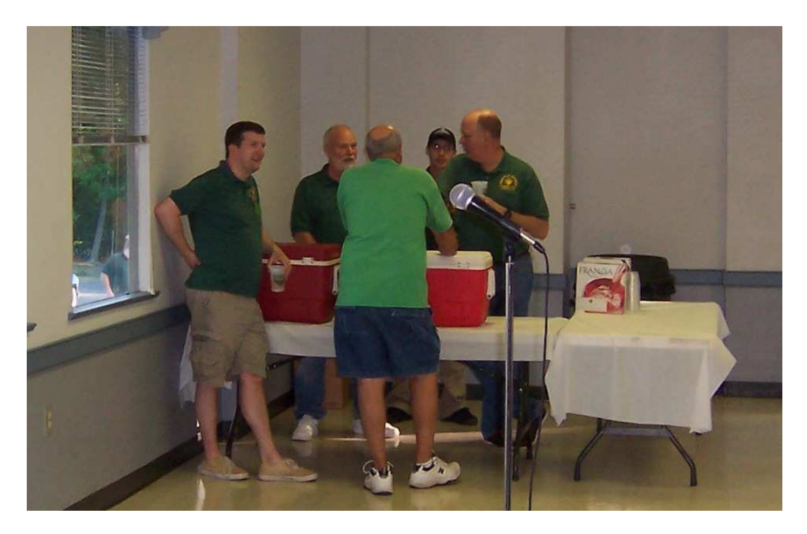
Our crack bar crew ready to snap to attention