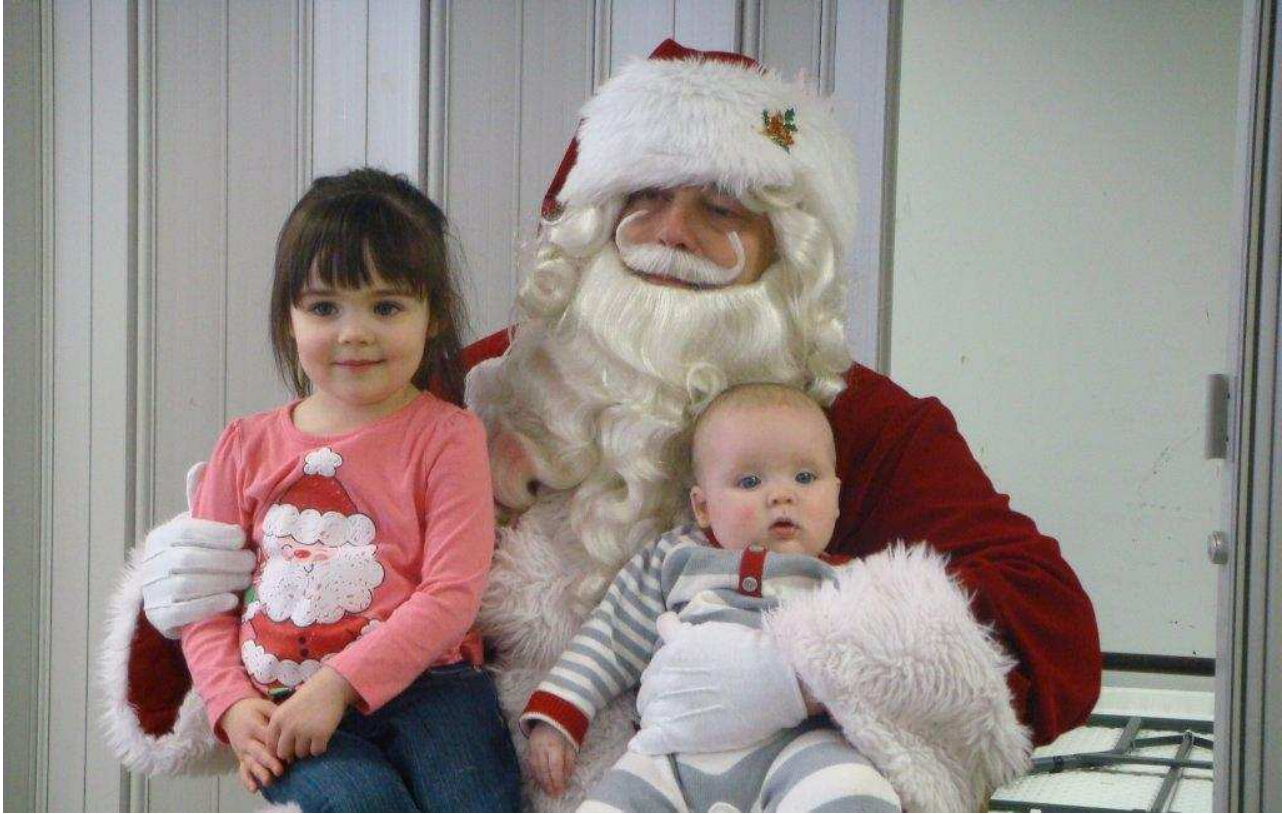
Santa Entertaining the Kids