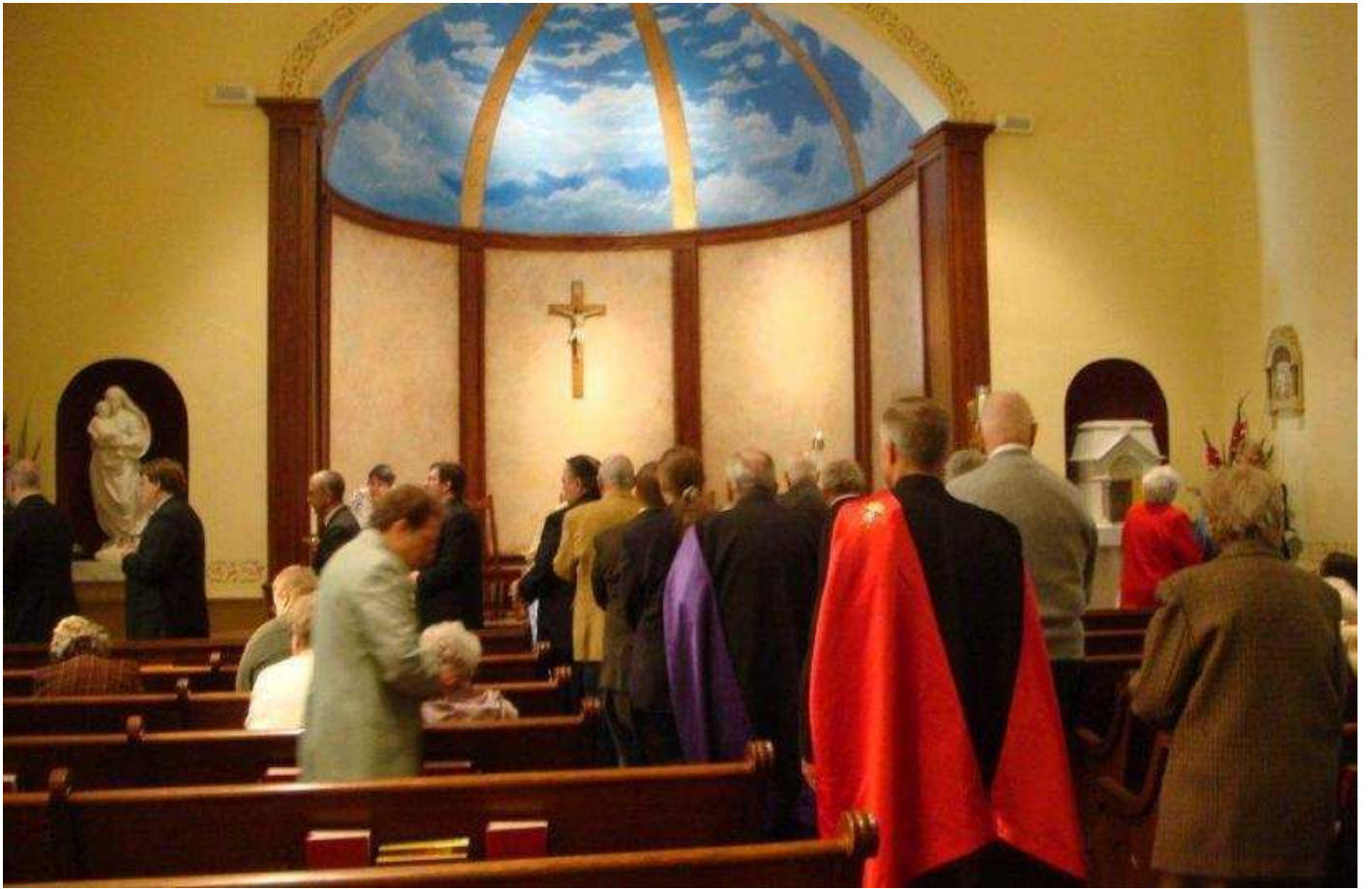
Sharing the Eucharist