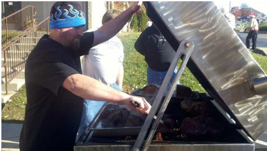
3 RD DEGREE PIT BEEF MASTER'S HAT AND HEAD WARMER