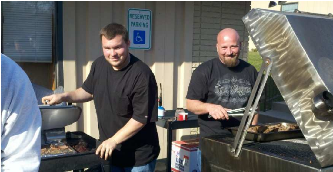
YE OLDE PIT BEEF MASTERS