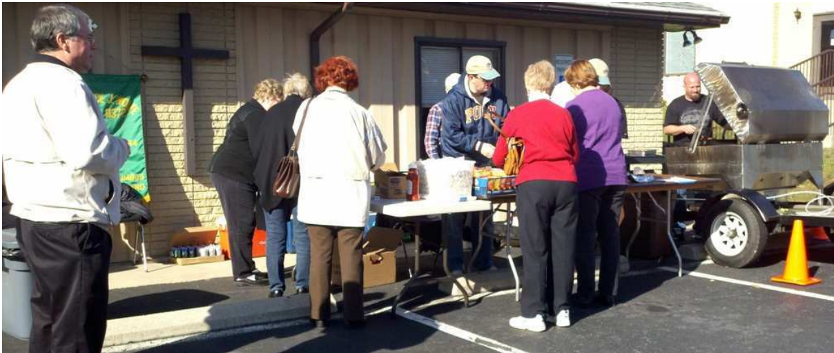
OVER 400 PIT BEEF SANDWICHES WERE SERVED WITH $1070 PROFIT TO THE PARISH