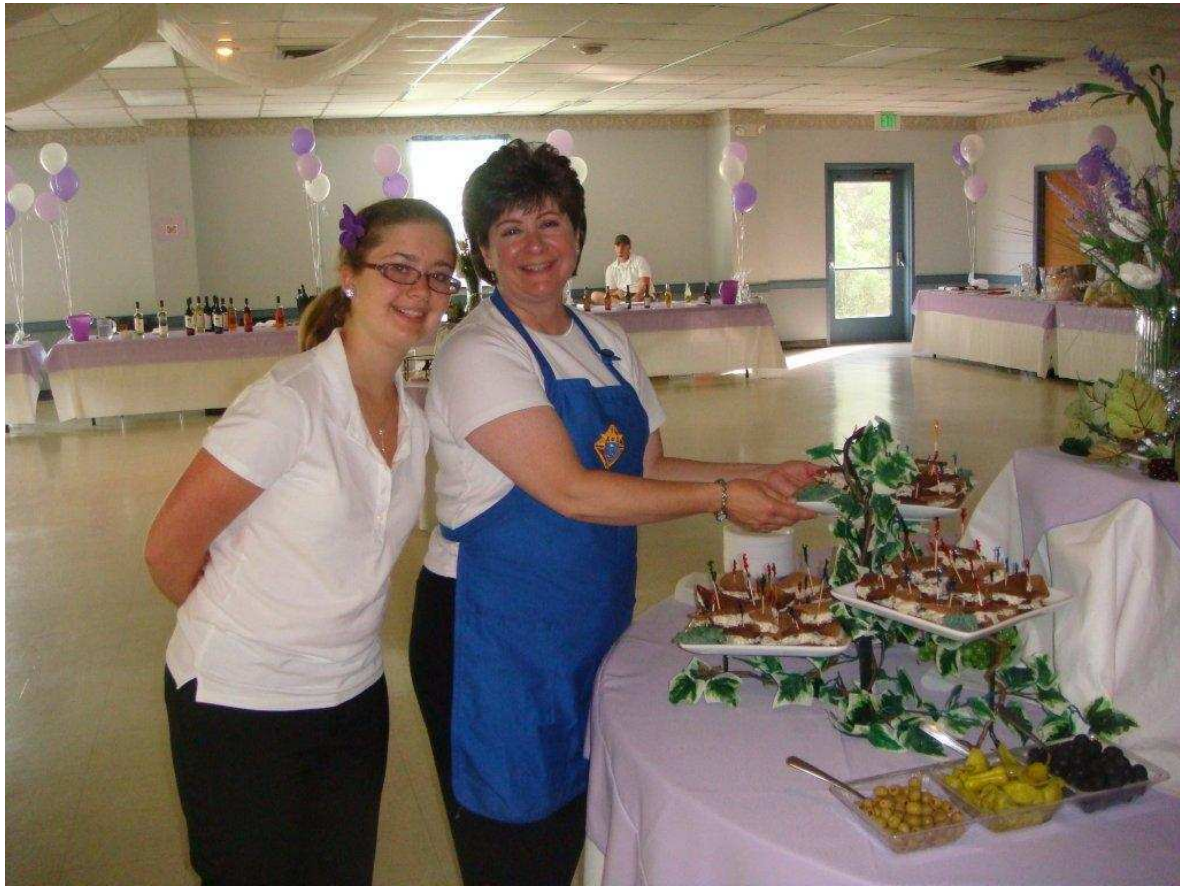
Two of the Sosna ladies looking lovely as usual