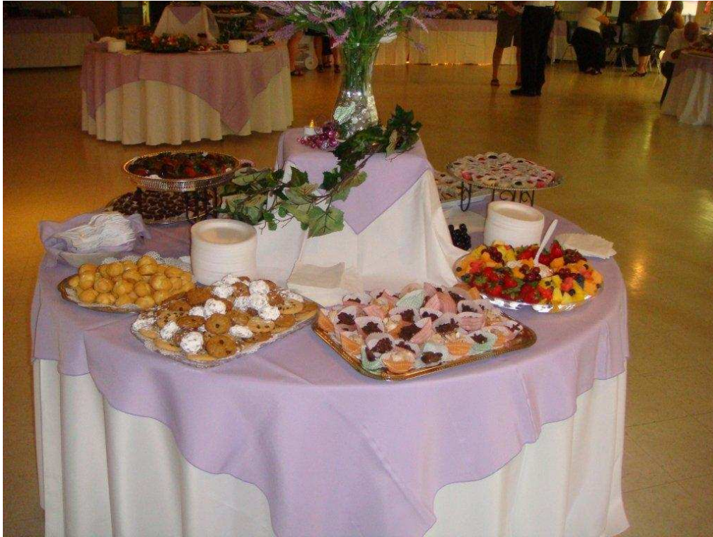
Refreshments available in abundance.