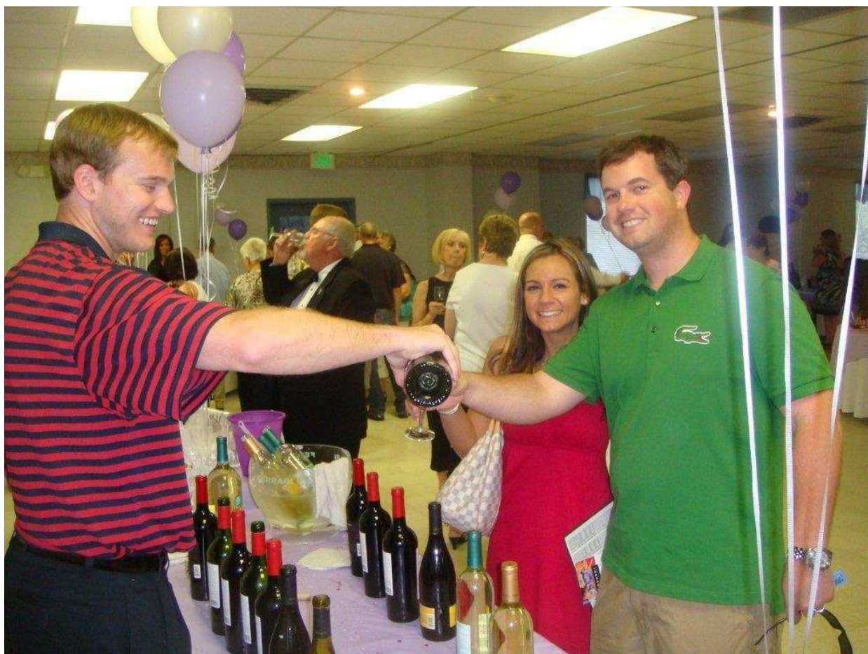
Let me taste that again.