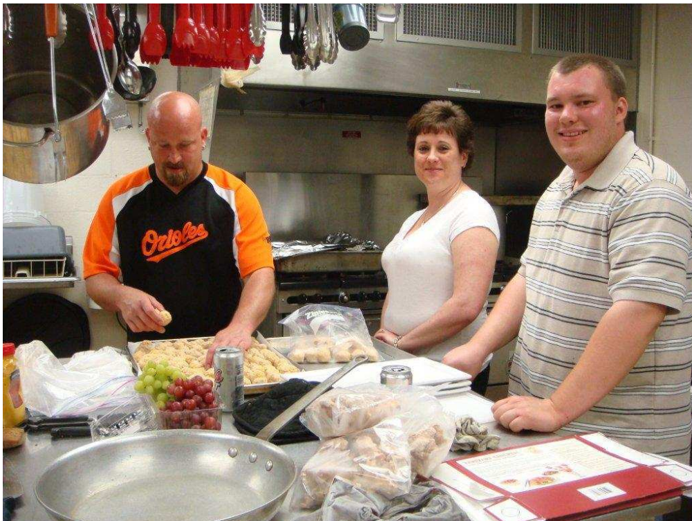
Part of the kitchen crew