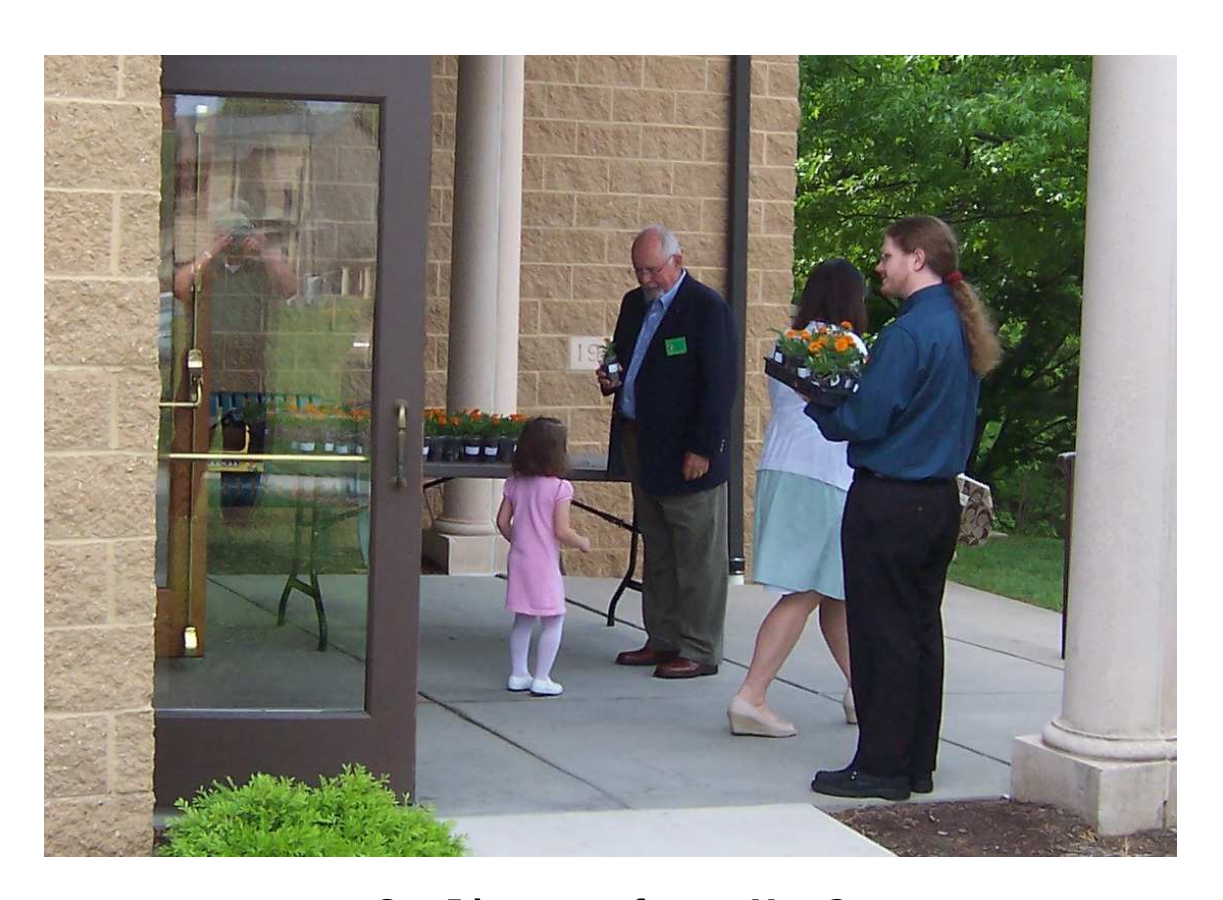
Can I have one for my Mom?