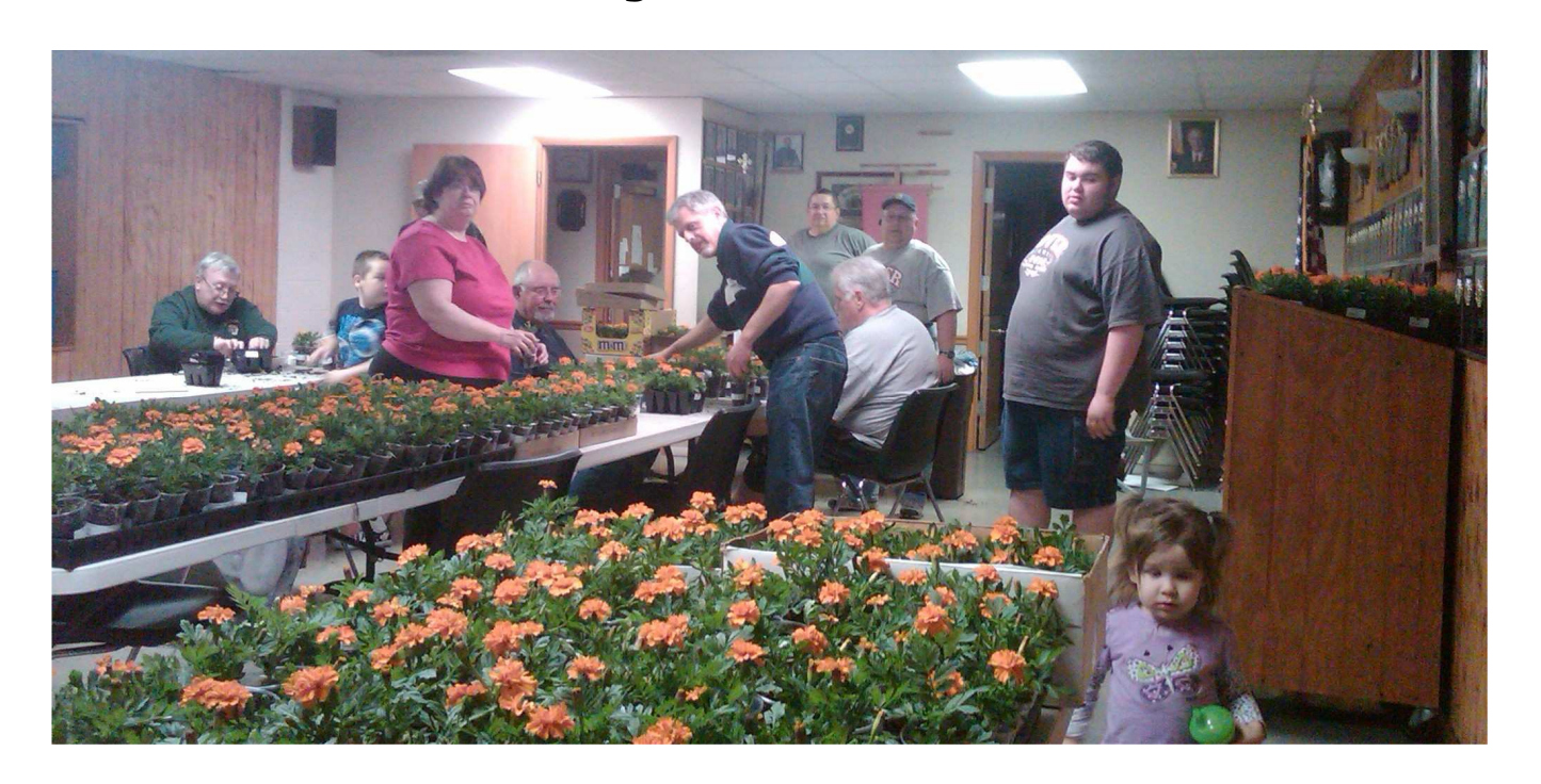
Transferring 800 marigolds to cups on Friday night