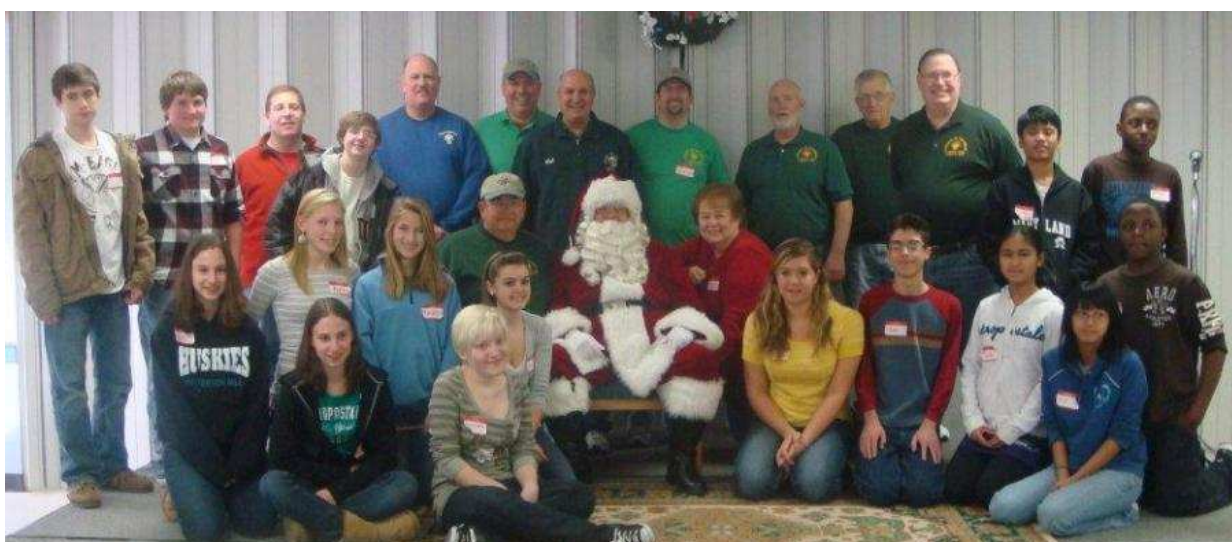
All the Volunteers