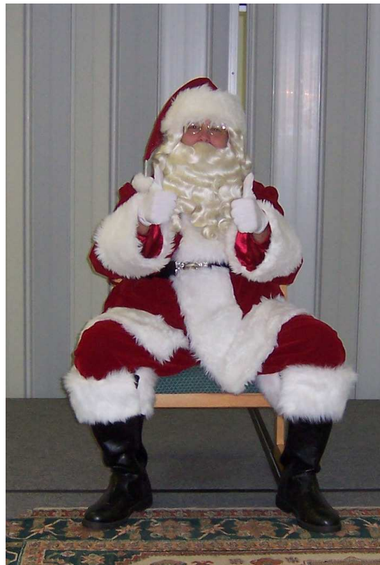
Before he leaves Santa exclaims, "Go Ravens!"