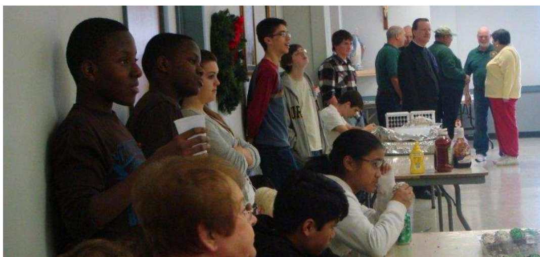
Our Youth Help Out