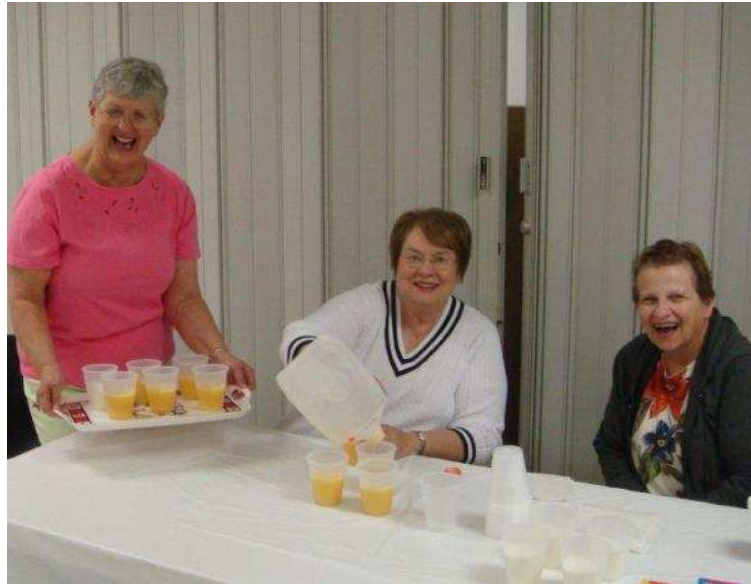
The Ladies Auxiliary Quietly Getting Juiced at the Pancake Breakfast