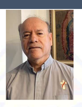
Worthy Associate Chaplain Message