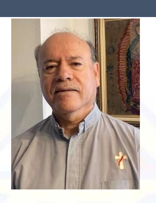
Worthy Associate Chaplain Message